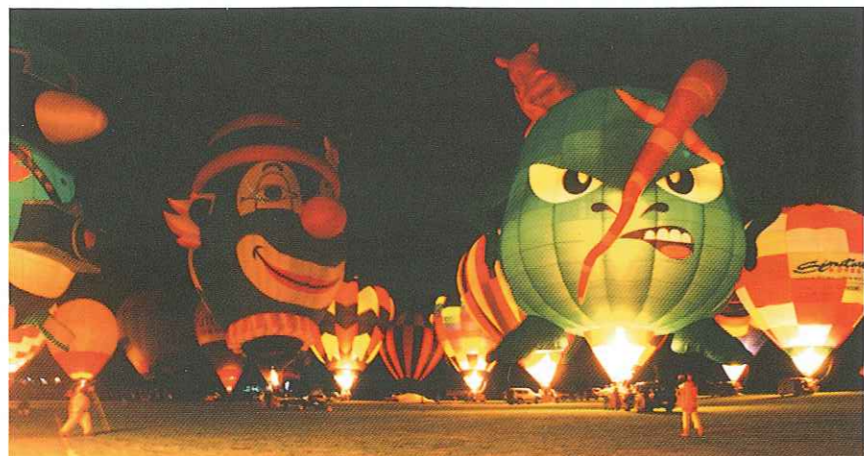
The Night Glow at Waikato University attracted a crowd of 80,000.

sponsor Kingsgate Hotel and two of the Kingsgate staff rode with us for their first balloon ride (after hotel management chose to put all their staff names into a draw). We followed the Aoraki Balloon Hare and flew to half a paddock from it (there was